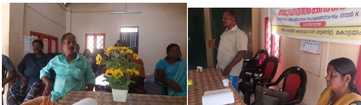
Photo No. 2: Orientation Meeting of Beneficiaries of Cattle Rearing at Kumarakom on 02 October 2019