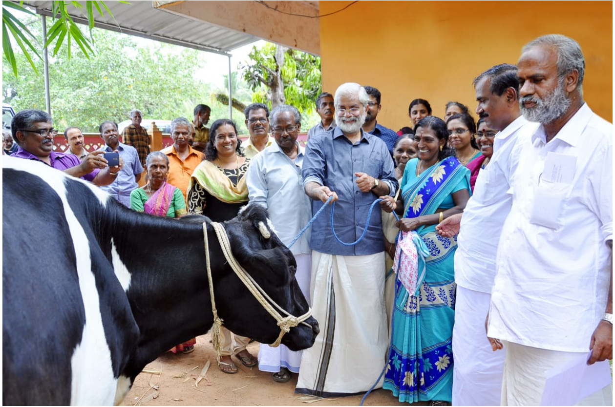
Photo No.3: Distribution of milch animal in Aymanam by the Com. Suresh Kurup, MLA Ettumanoor Assembly Constituency on 27 February 2019

ensured of getting such animals. The distribution of milch animal in Aymanam is done by Com. Suresh Kurup, MLA, Ettumannor Assembly Constituency on 27 February 2019.