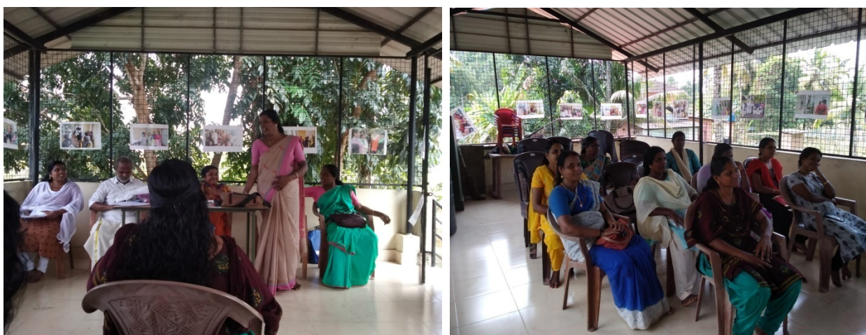
Photo No.23: Inauguration of the Repair of Electronics Equipment Training at Aymanam