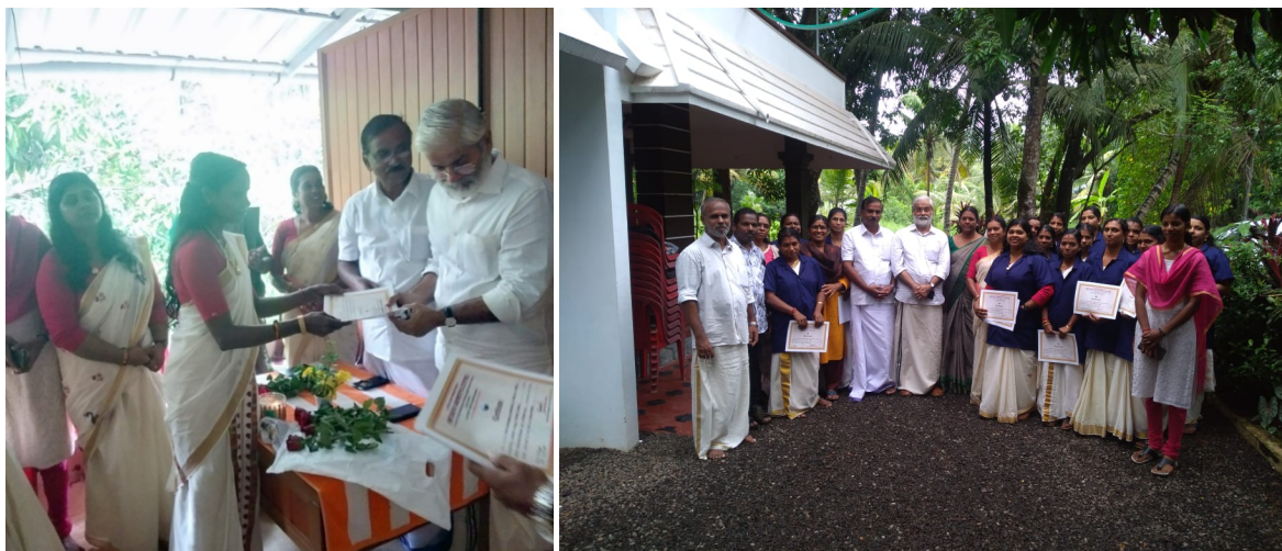
Photo No.14: Certificate Distribution to Trainees on Plumbing at Aymanam by Com. Suresh Kurup, MLA Ettumanoor Assembly Constituency on 19 July 2019

The name of the plumbing unit is Phenix. They have been associated with the well recharging works of Aymanam Gram Panchayat.