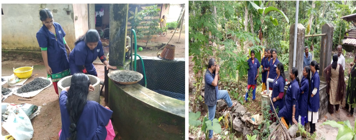
Photo No. 30: Phenix Plumbing Group Engaged in Well Recharging Work

The Phenix plumbing group in Aymanam had completed their training in July 2019. After the training, eight members of the group have been actively participating in the well recharging work of Aymanam Gram Panchayat. They have also done the plumbing works in the nearby areas. The members in this group are now satisfied with the earnings from their work.