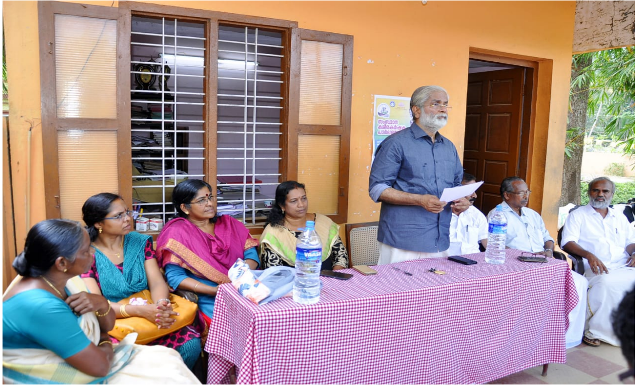
Photo No. 4: Meeting at Aymanam for the distribution of cow on 27 February 2019

The local MLA has appreciated the project by certain reasons. He himself admitted that cattle rearing have high potential in his constituency and he has taken keen interest to attend it.