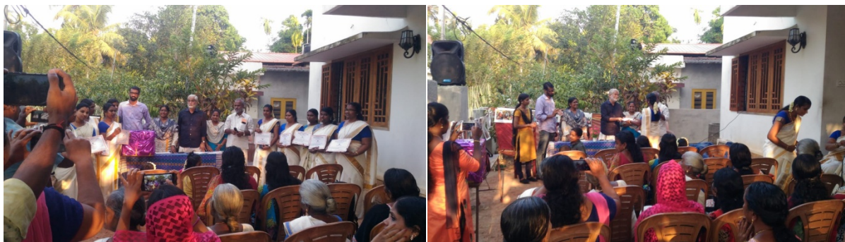
Photo No.27: Certificate Distribution of Mobile Servicing Training at Aymanam by Adv. Suresh Kurup, MLA on 01 February 2020