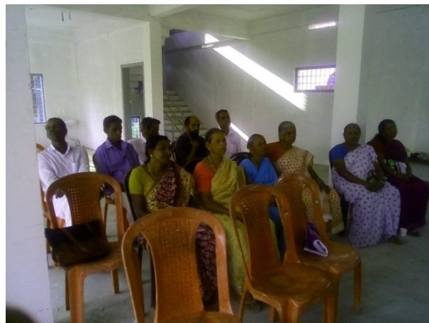
Photo No. 1: Orientation Meeting of Beneficiaries of Cattle Rearing at Aymanam on 31 January 2019